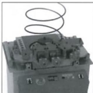
SPIRAL HOOP DEVICE OPTIONAL