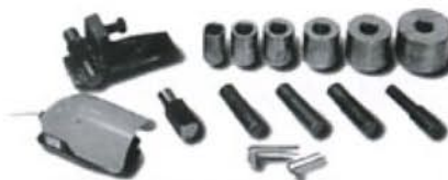
TYPICAL ACCESSORIES PINS, ROLLERS, FOOT PEDAL