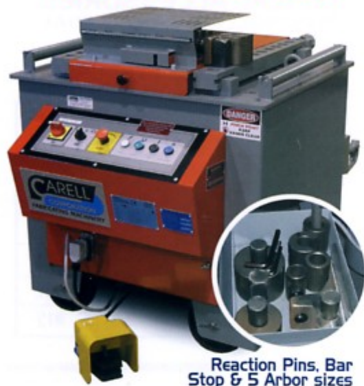
Reaction Pins, Bar Stop & 5 Arbor sizes