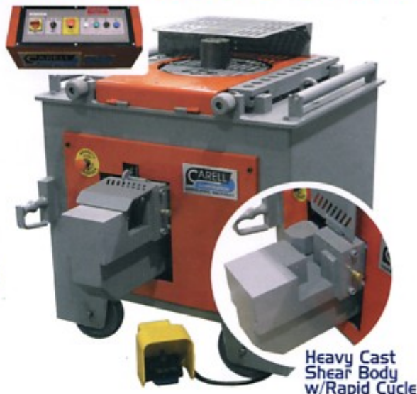
Heavy Cast Shear Body w/Rapid Cycle