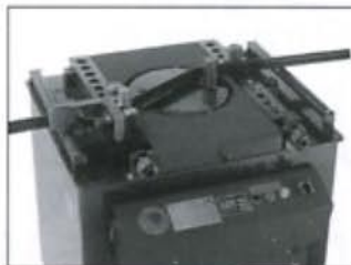
LEFT/RIGHT STANDARD Produce Double Bends and bend from Left or Right