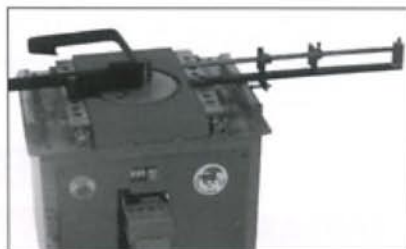
STIRRUP ACCESSORIES Optional, stirrup bending tool & adjustable length stop